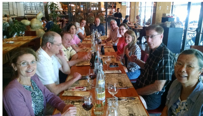
Lunch at San Daniele Prosciutto Factory