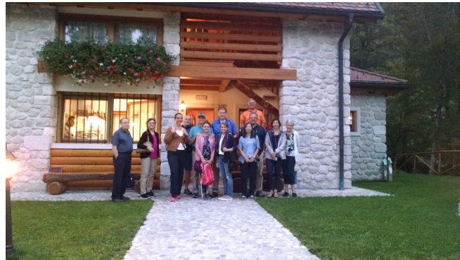
Dinner at Lake Barcis