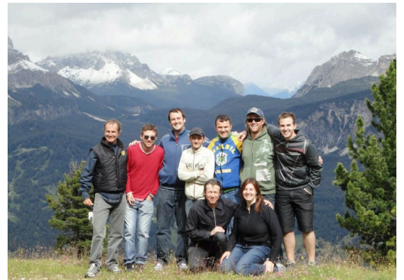
Part of the YA group in 2011 on the way to Cortina