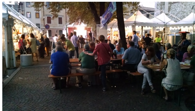
Friuli DOC Wine and Food festival in Udine