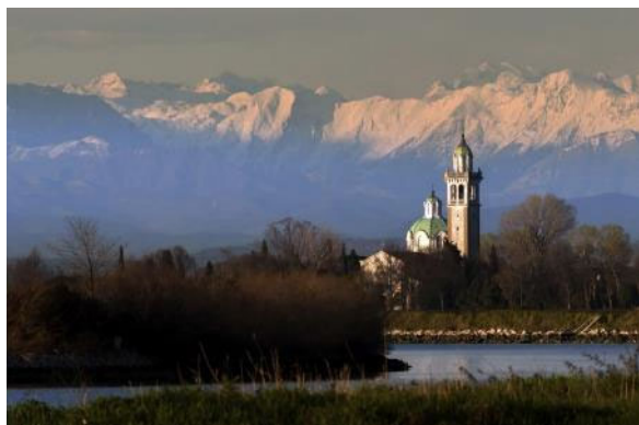
Santa Maria di Barbana, Grado Friuli

White and red still wines within Friuli DOC must contain a minimum alcohol level of 10.5% alcohol, while sparkling wines must achieve a minimum alcohol level of at least 11%. No significant production rules exist for the various still wines of this DOC, however there are quite a few rules specific to the aging and varied fermentation methods of the sparkling “spumante” wines of Friuli DOC .